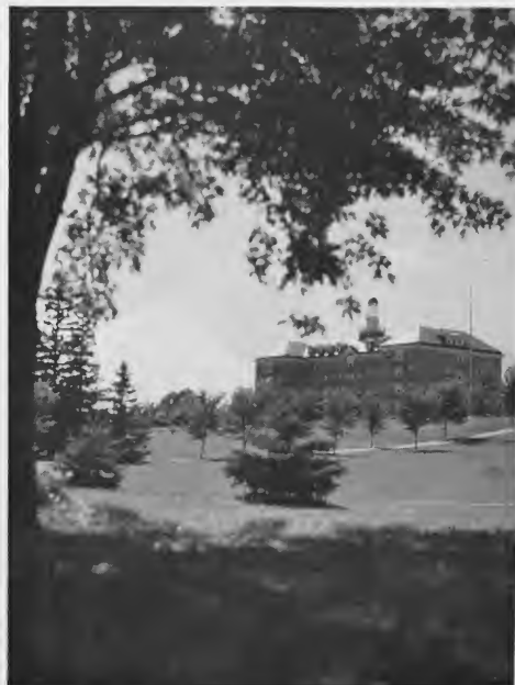
To the Ladies

As a social document, "Stagecoach North" makes of Middlebury the "Middletown" of the early nineteenth century. As a book, it makes good reading any day.